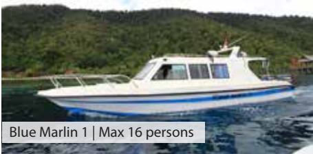
Blue Marlin 1 | Max 16 persons