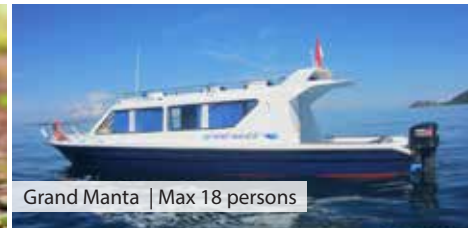
Grand Manta | Max 18 persons