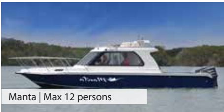
Manta | Max 12 persons