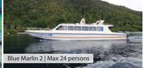
Blue Marlin 2 | Max 24 persons